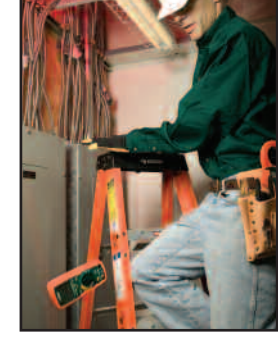
Drop proof test assures user that the meter will still operate when accidentally dropped within 6ft